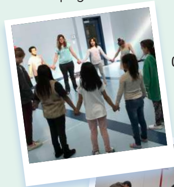
Christian school prayer circle

As servants of Christ, we are called to reflect the grace and compassion that our Saviour has shown us. Every day, we are reminded of the impact love and kindness can have on even the most troubled hearts. Jesus came to the world as the true Light to overcome the darkness. We know that God is bigger and greater than darkness, and He can use us, the workers here at Union Gospel Mission, to be a shining example of that Light in one of the darkest areas of Winnipeg.