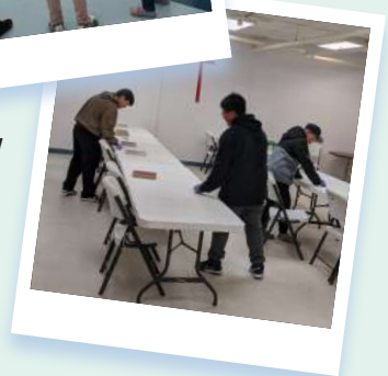
Faith Academy cleaning classroom