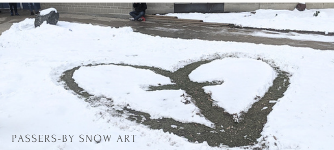
PASSERS-BY SNOW ART

Thank you to those of you who donate provisions. Food; vegetables in season, baking treats, breads, meats and juices. (Cont. on page 2)