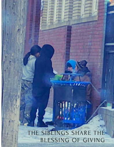
THE SIBLINGS SHARE THE BLESSING OF GIVING

Over 40 recipients were blessed, including some who sobbed with delight.