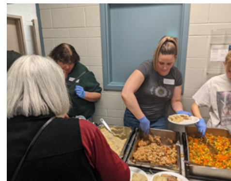
Plating food at Christmas dinner