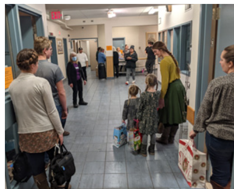
Gifts to each guest