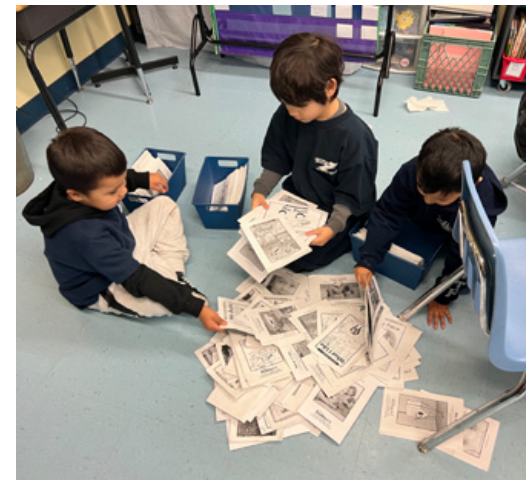
Children tidying up

Immediately after the teacher was able to get the distraught child out of the classroom, three boys from kindergarten started to clean up the disaster that was left behind. They went around the room, gathering all of the books from the floor and then put them in a pile so they could sort them as best as they could into the bins they belonged in. It was truly inspiring to see these three young boys show complete selflessness and compassion for their fellow peer. Understanding that their friend was having a bad day, they took it upon themselves to clean up his mess. After cleaning up all of the books, these three young boys began to hug each other, displaying pure love for each other. After just a few short months of knowing each other, they have formed an incredible bond that we hope will only continue to grow stronger.