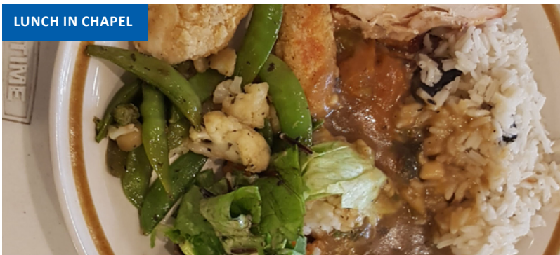
LUNCH IN CHAPEL